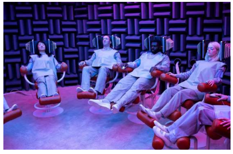
Caption: A scene from Fukunaga's Maniac

But I fear I have painted quite a bleak picture. There have been many sympathetic and sensitive depictions of mental health, be it Black Swan, Maniac, Silver Linings Playbook, or the crowd favourite Bojack Horseman. Winona Ryder's character in Girl, Interrupted (1999) details her account of her experience at a youth psychiatric hospital. While often melodramatic, the portrayal of borderline personality disorder (BPD) by Jolie's character is sympathetic and raw, and true. Another honorable mention of an accurate portrayal of BPD is Silver Linings Playbook (2012) portrayed by Bradley Cooper.