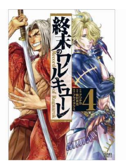
Caption: Sasake Kyoiro vs Poseidon

If you are bored by the typical clique romance or adventuring fantasy literature, I suggest you try Record of Ragnarok. It's a good read with incredible yet easy to interpret fight scenes and certainly make you question whether a god is really just a human drowned in strength. The scenes can be grotesque and seem very violent but it's a good change of pace. The manga is popular and is even releasing its adaptation in the coming months!