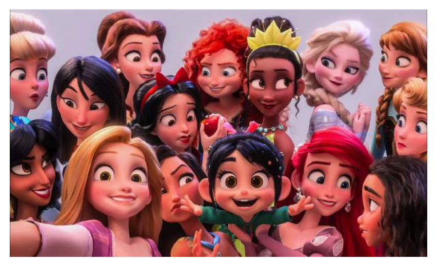
Caption: Disney's Princesses

Disney has been a part of everyone's childhood whether it be Disney Pixar films, Marvel, classic Disney productions featuring the princesses we know and love, or even cartoons. Children are believed to be very vulnerable when it comes to media in terms of how it plays an important role in teaching children about societal beliefs, and it can sometimes have a negative impact on a child's psychology. Children have a hard time differentiating between what is right and wrong and when Disney produces movies that portray women in an unrealistic manner with unrealistic beauty standards, this can set a bad precedent for what male and female beauty standards should be.