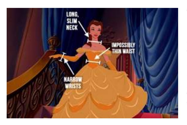
Caption: Belle from Disney's Beauty and the Beast

Taking up the example of the Sleeping Beauty, she is depicted as a classic damsel in distress, relegated to suffering until the curse cast upon her is lifted by a prince. Ariel is depicted as rebellious and independent but she gives her voice up and leaves her entire family for a man she barely knew. This is probably the most atrocious Disney movie plot ever made and it also doesn't give an appropriate message to young viewers. Taking up the movie Mulan, it is a great movie and I like it because it shows us how brave and powerful she was, but I think the only problem was that she still ended up with a romantic interest which sort of contradicts the whole plot of the movie.