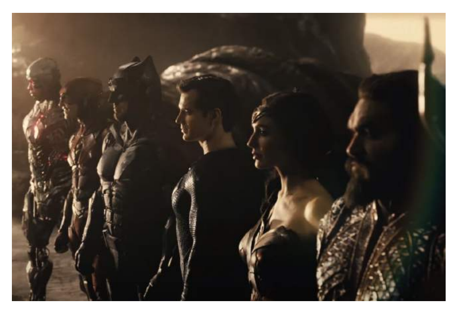
Caption: Zack Snyder's heroes

Zack Snyder's Justice League deserves to be praised after what he was able to pull off even though the last Justice League was an absolute disaster. This movie was well-received by all, and everyone now has high expectations from DC movies.